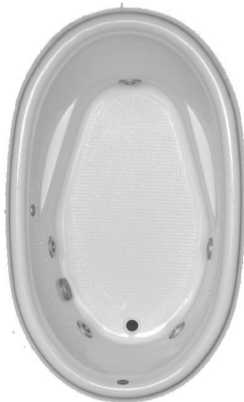
208d spec sheet

Inside Bottom Dimension 40"L x 24"W (+/- 1/2")