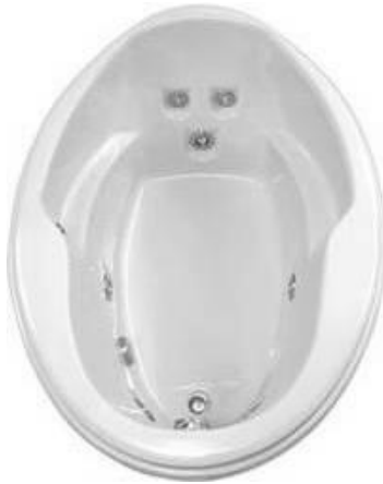
60"x41.5"x22" Shipping weight - 140lbs

Upper body jets can be shut down for operation at lower level