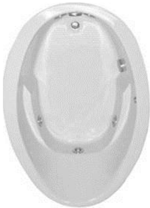
56"x38"x21" Shipping weight - 100lbs

Inside Bottom Dimension 40"L x 24"W (+/- 1/2")