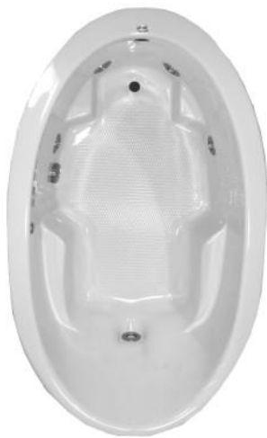
72"x42"x25" Shipping weight - 160lbs

Inside Bottom Dimension 48"L x 29"W (+/- 1/2")