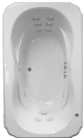
72"x42"x22" Shipping weight - 180lbs